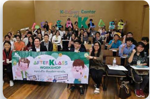
KBank held an activity to promote financial literacy skills of young members of AFTERKLASS online community at K-Expert Center, Chamchuri Square Building.

The Bank abides by lending terms and conditions, including guarantee stipulations, and all legitimate duties to creditors, debenture holders and depositors. The Bank has in place the capital management directions that comply with related laws, regulatory requirements, and international guidelines and practices. In compliance with related laws, accurate and appropriate explanations have been given to creditors on all of the possible risks involved with non-deposit financial services. In case the Bank is unable to comply with any established conditions, advance notification will be made to related creditors in order to jointly resolve the problems.