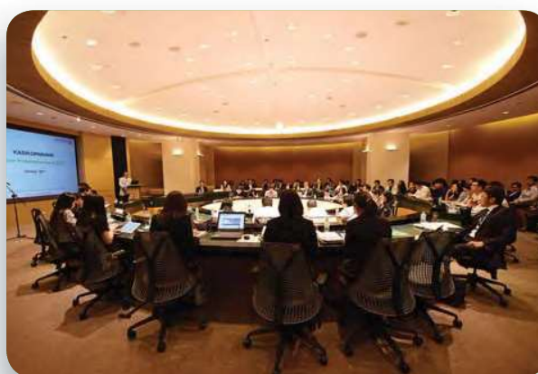
KBank Chairman of the Board and the Chief Executive Officer met analysts and fund managers at "KBank Annual Analyst and Thai Fund Manager Meeting" at KBank Head Office.