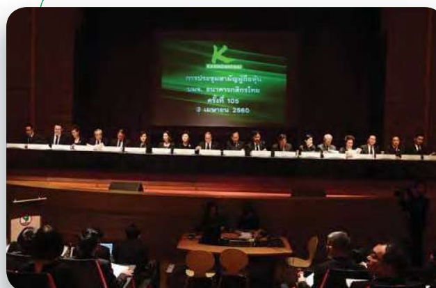
The General Meeting of Shareholders No. 105 at KBank Head Office